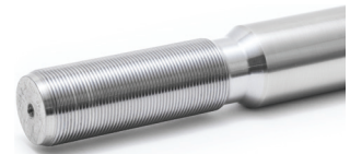
Ariel "necked-down" piston rod design