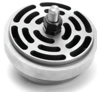
Application-Specific Efficient Valves