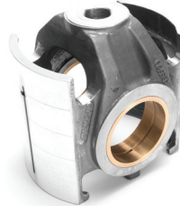
Rugged one-piece Crosshead